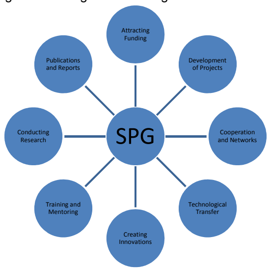
Figure 3. Functions of scientific project group.

Ukrainian universities should more actively support the creation and functioning of scientific project groups as a means of attracting academic resources to research and promoting scientific development. SGPs play a key role in shaping the academic environment, promoting the exchange of knowledge and the creation of innovative ones.